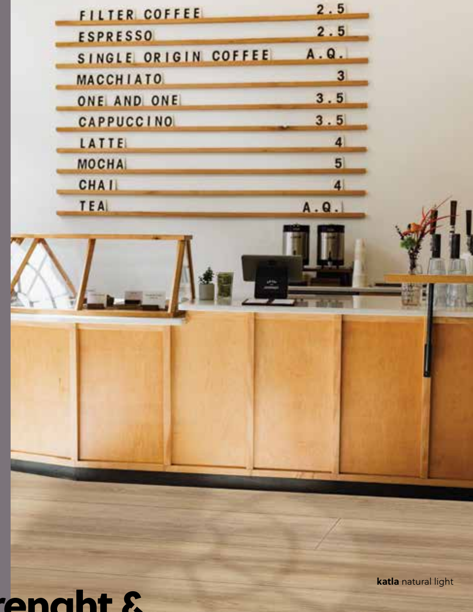
katla natural light