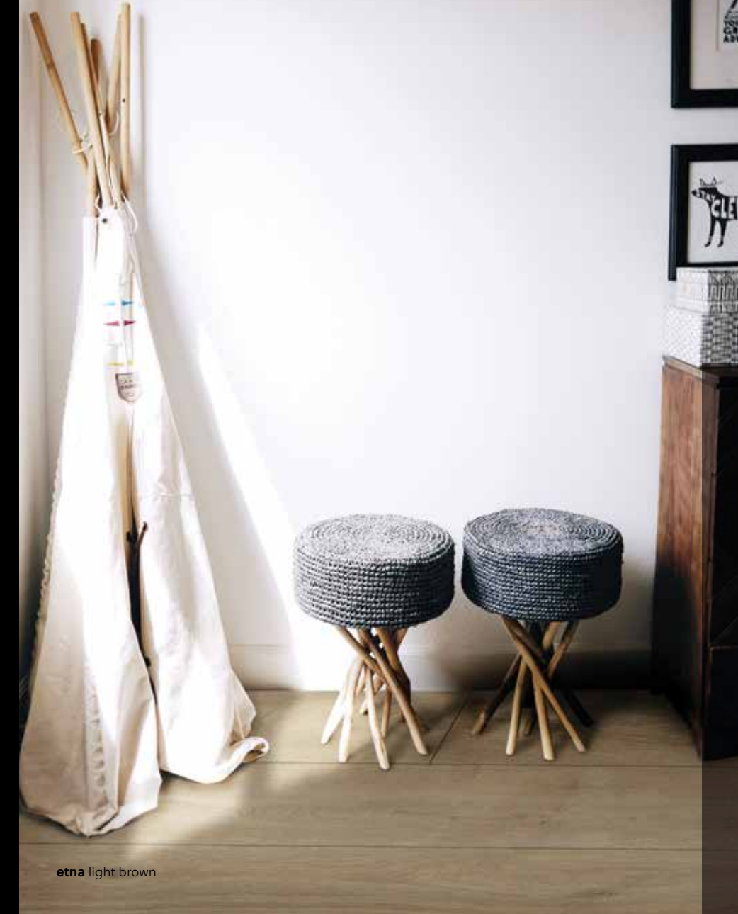
etna light brown

Designed & made in Norway, Grand Majestic represents the latest evolution in the progressive technology of BerryAlloc® High Pressure Floors. Merging trend shaping aesthetics with high performance, Grand Majestic is the pinnacle of our HPF innovation: the world's strongest laminate floor in a plank of extraordinary dimensions that remains easy to fit and simple to care for.