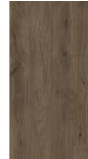
etna dark brown 62001988