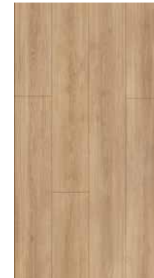
katla natural light 62001989