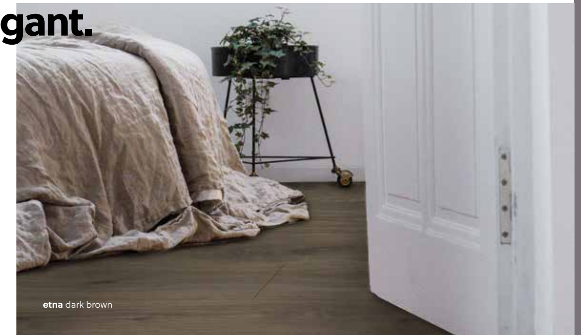
etna dark brown

In timeless and elegant wood decors, Grand Majestic captures the calming and soothing force of nature in a floor that can handle everything life can throw at it.