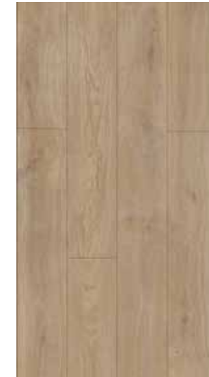
etna light brown 62001986