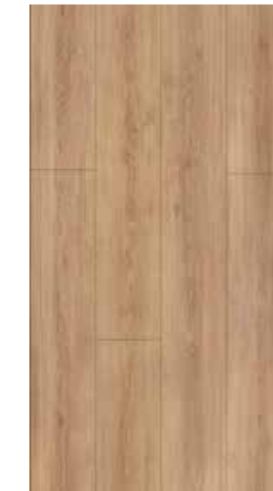
katla natural honey 62001991