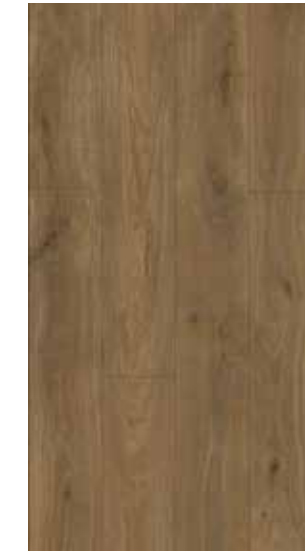
etna brown 62001987